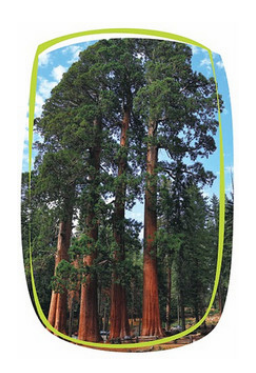
NY State Dept. of Environmental Conservation http://www.dec.ny.gov/land s/47481.html